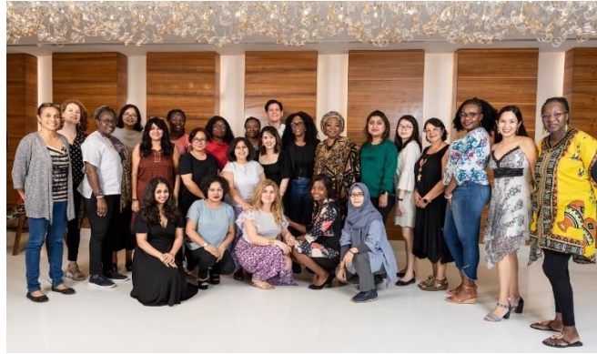
Pic: WRO 2022 Meeting