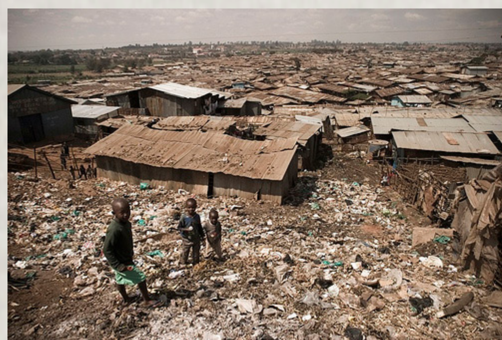
Civil Society is much bigger than the world of formally constituted NGOs that seek to address these issues