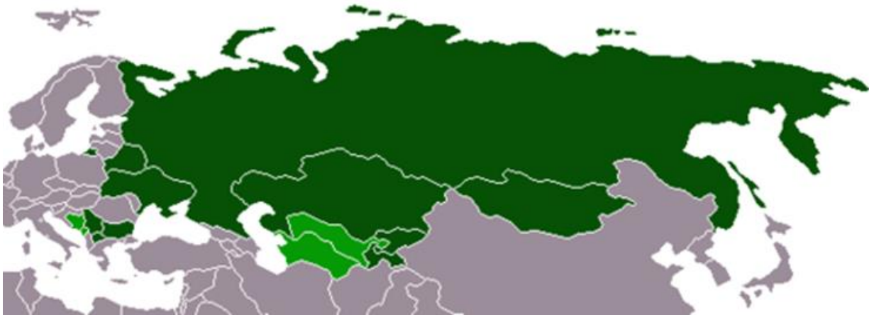
Figure 1: Geographic territories spread of Cyrillic