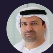
Dr. Marwan Alzarouni

Domain Days Dubai stands at the forefront of a transformative era, seamlessly bridging the well established realms of Web2 Domains with the innovative, decentralized world of Web3 innovations. This convergence not only heralds a new chapter in digital identity and security but also empowers users with unprecedented control and opportunities in the domain name space. As we navigate this pivotal junction, the insights and collaborations fostered here in Dubai are instrumental in shaping a future of the industry where technology serves as a beacon of empowerment and inclusivity