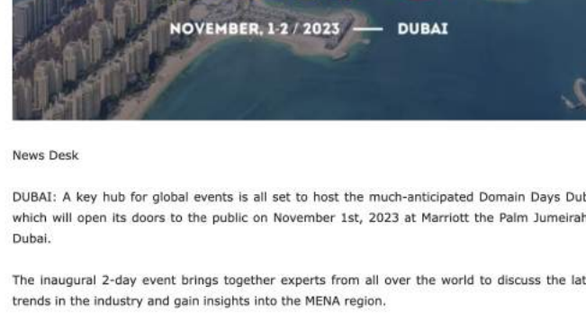
مؤتمر "أسماء النطاق" ينطلق الأسبوع المقبل في دبي