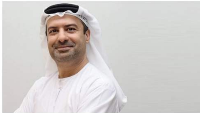
مؤتمر "أسماء النطاق" ينطلق الأسبوع المقبل في دبي