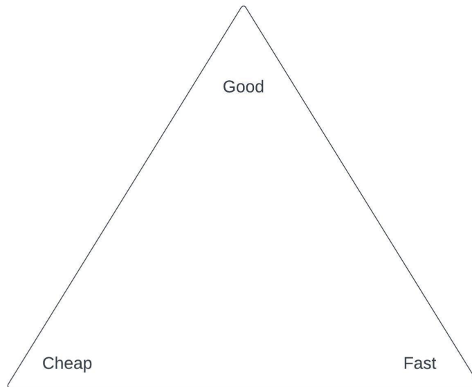
Figure 1: Good, Cheap, Fast Trilemma

Zooko's Triangle is a trilemma first proposed by Zooko Wilcox-O'Hearn in 2001. 6 It can be a useful tool for understanding trade offs in designing naming systems. It postulates that the three fundamental properties desired in a naming system cannot all be achieved in the same naming system. According to Zooko's Triangle, trade-offs must be made when designing a naming system and any design can only achieve two of the three properties. The three properties are Distributed , Secure , and Human Memorable . Distributed means that the name does not rely on a single point of trust (i.e., a single root). Human Memorable means the names are meaningful and memorable to users. Secure means that a user, or their agent, can authenticate the name.